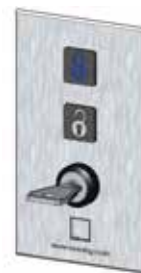
Pic. 4: control panel mode "close movable wall"

In this position (see pic. 6) the wall is deactivated and the key must be removed.