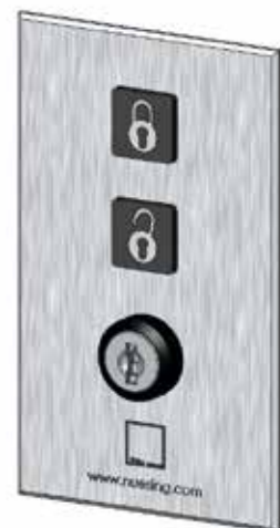
Pic. 12: Control panel mode "neutral"