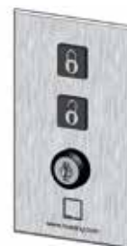
Pic. 6: control panel mode "zero/neutral position"