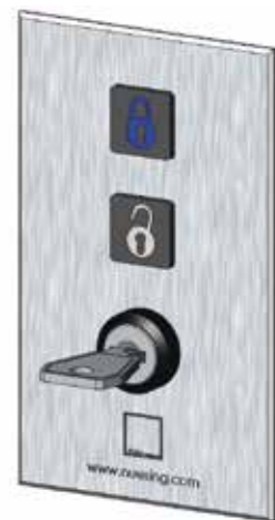
Pic. 11: Control panel mode "close movable wall"

Turn the control panel key to "neutral" and the remove the key. (see pic. 12).