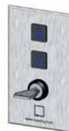
Pic. 5: control panel mode "open movable wall"