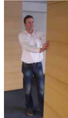
Pic. 1: Panel movement

Our movable walls don't need any maintenance! We recommend, however, an annual inspection by our service team.