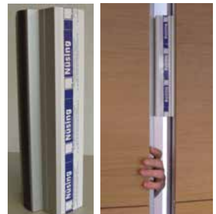
Pic. 2 – 3: left stopper, right stopper in use